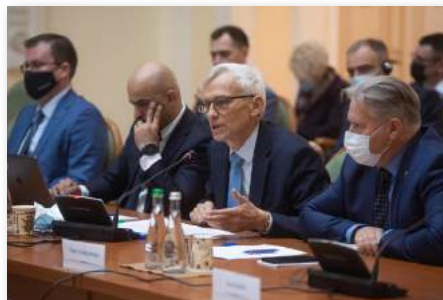
Marcin Swiecicki met with Polish business within the meeting of the First Vice Prime-Minister-Minister of Economy of Ukraine Oleksii Liubchenko with investors