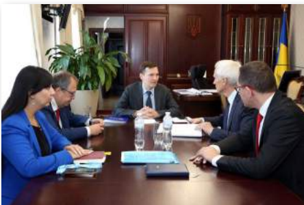
Marcin Swiecicki met with the First Deputy Minister of the Internal Affairs Yevhen Yenin in relation to the establishment of the Office for Business Protection