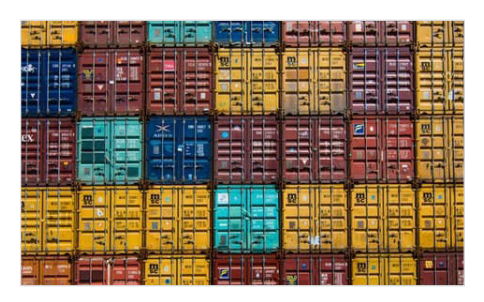
International express shipments released from under arrest