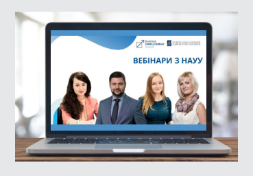
BOC continues holding practical seminars with the Ukrainian National Bar Association