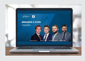
The first project of webinars with the Ukrainian League of Industrialists and Entrepreneurs: summary