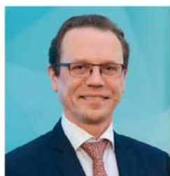
Algirdas Šemeta Business Ombudsman

This is an independent representative of entrepreneurs' interests under the Cabinet of Ministers. He considers complaints of both domestic and foreign entrepreneurs regarding unlawful actions of state bodies.